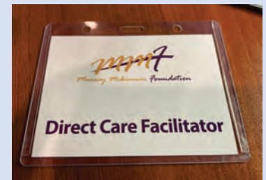
DIRECT CARE FACILITATORS ON THE SCENE