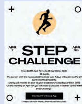
C4S STEP CHALLENGE