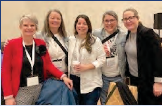
LH COMMUNITY EVENT