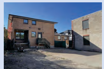
MCKINNON YARD AFTER