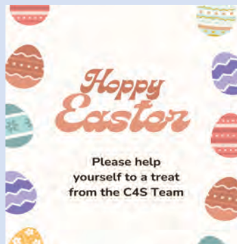
C4S EASTER EVENT