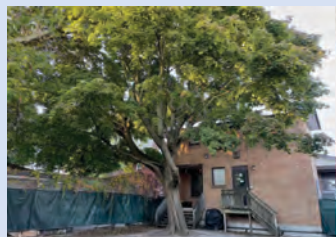
MCKINNON YARD BEFORE