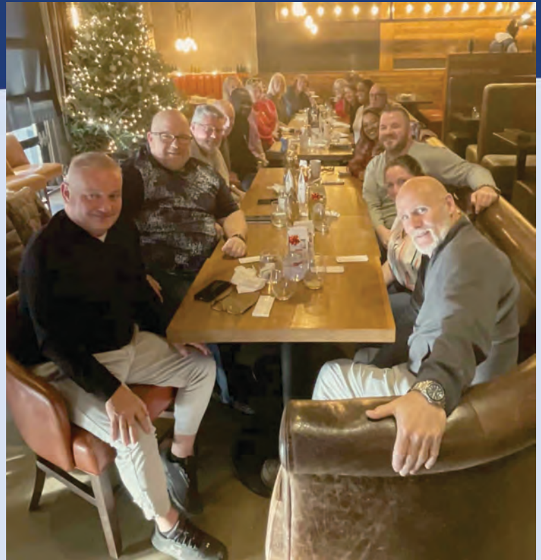
BOD, BROADER ADMIN, OFFICE TEAMS