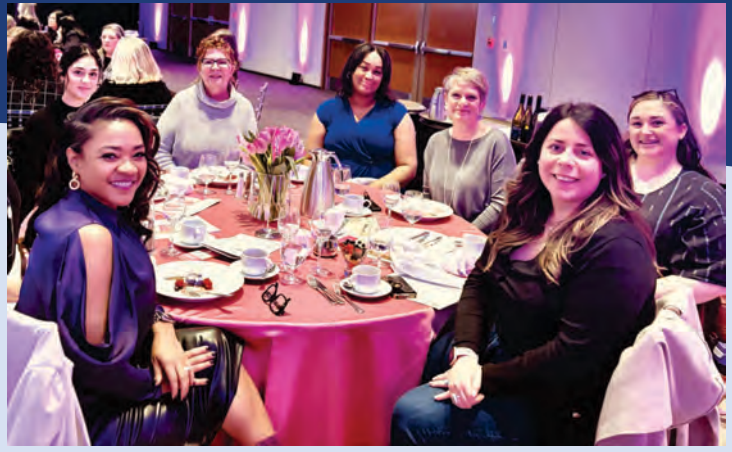
WOMEN'S COLLEGE HOSPITAL EVENT