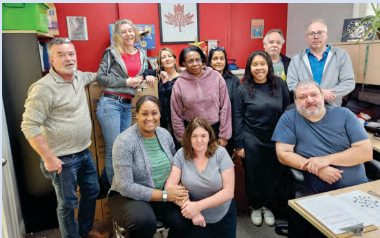
ATTENDANCE CENTRE COMMUNITY BASED STAFF