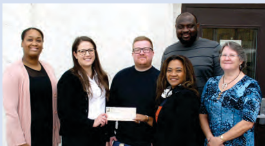
CSWB LEAVE GRANT RECIPIENT