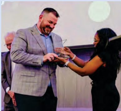
NORTH STAR AWARD RECIPIENT 2023