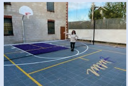
NEW SPORTS COURT