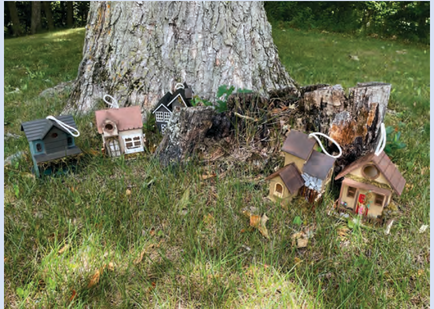
LH BIRD HOUSE ART

Lavender Hill's internal Survivor Advisory Initiative has maintained its contribution to the Specialized Services internal programs and processes. Meeting once a month, they have provided critical feedback to our housing services, reviewing documentation and offering insights into day-to-day program activities. There is tremendous appreciation for their time and contribution in a manner that is reflective of their experience and expertise. We recently concluded the Advisory's first year and are preparing a call for new/additional members in the new year.