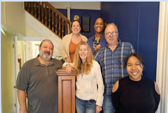
ATTENDANCE CENTRE COMMUNITY BASED STAFF