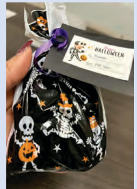
C4S HALLOWEEN GOODIES