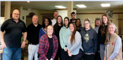
OSHAWA PROGRAM TEAM DAY

2024/2025 Detention 61 Average Stay 16 Days Open Custody 15 Average Stay 55 Days Credits Earned 35 College Credits Earned 2 DZ Licence Achieved 1