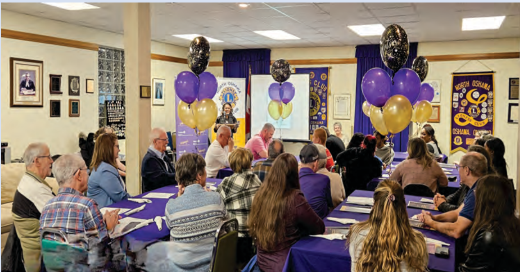
YOUTH RECOGNITION AWARD NIGHT 2024