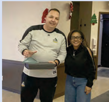
NORTH STAR AWARD RECIPIENT 2024